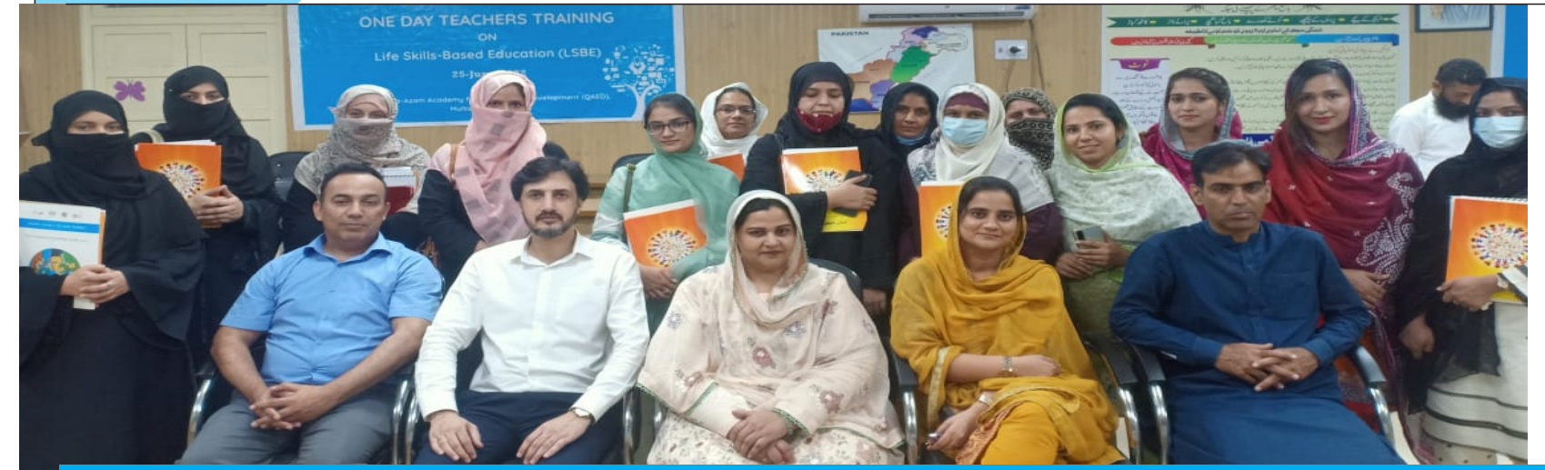
Teachers' Training on Life Skills-Based Education (LSBE)

In conclusion, I want to express my gratitude to UNFPA in particular for extending their support for the promotion of LSBE on behalf of all of our stakeholders and donors. We promise to make the same efforts to inform more people about LSBE in the future days and months in order to bring about change for the better for our generation and Pakistan.