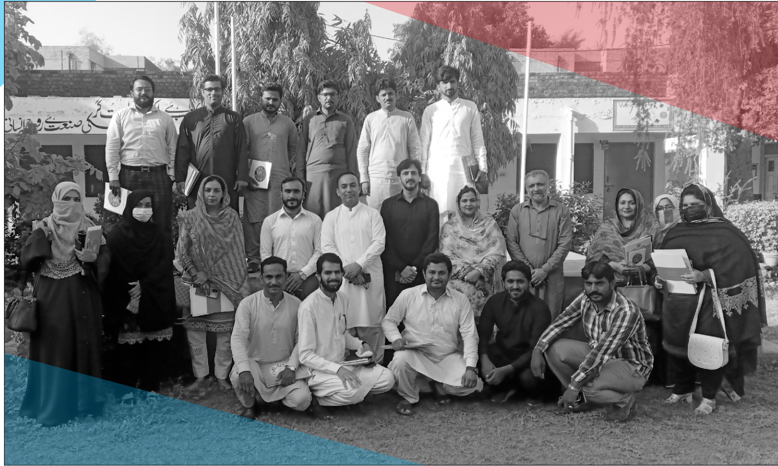
Teachers' Training on Life Skills-Based Education in AJK, KPK & South Punjab

The training was organized in continuation of the Teacher's Training program of NCC with a particular focus on Life Skills Based Education. For this purpose, ACT, in collaboration with National Curriculum Council (NCC), Ministry of Federal Education & Professional Training (MoFEPT) Government of Pakistan, developed LSBE-focused teachers' training manuals. The manual adopts an inclusive approach for the capacity building of teachers who teach students as an integrated subject and has been developed keeping Pakistan's educational demographic and socio-economic realities in mind. A great number of teachers have been trained on LSBE across Pakistan. These trainings were conducted mainly in the areas of AJK, KPK and South Punjab.