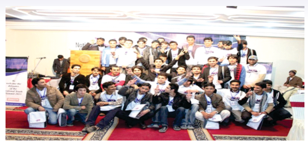
Participants of NYS 2013: